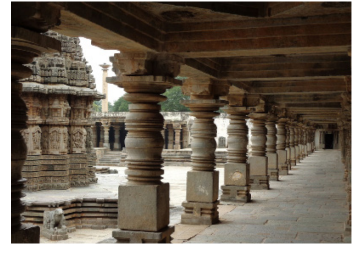
Stone pillar carving in Channa keshava temple and this is the long pathway beside the main entrance showing great maneuver.

Somnathpur one of the famous Hoysala kingdom. Hoysalas are. the most powerful rulers who kept most was a sort of incentive for part of Karnataka under them granted by the rulers. their power and control between AD 1100 and 1320. It was under the rule of the Hoysala king Vishnuvardhana, a patron of arts and sculpture, that a number of temples with fabulous architecture were built. These rulers were famous for their peacefulness. So they encouraged and created a healthy competition between the artisans. This policy ultimately resulted as beautiful temples and sculptures with intricate craftsmanship. These arti-