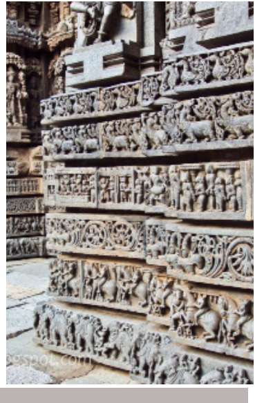
Pic 1 Lord Krishna Statue at Keshva temple Somnathpur Pic 3 Stone craving around the temple Pic 2 Lord channa keshava inside of the temple